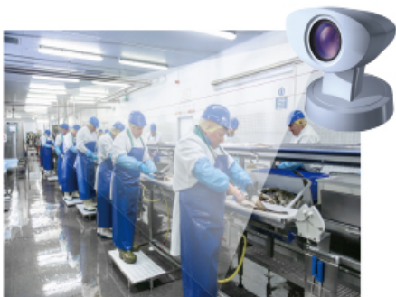
IP camera images supported

In the event of an emergency or a problem, you don't need to go on-site, but can quickly ascertain the situation, make fast decisions and give instructions, resulting in improved traceability and customer satisfaction.