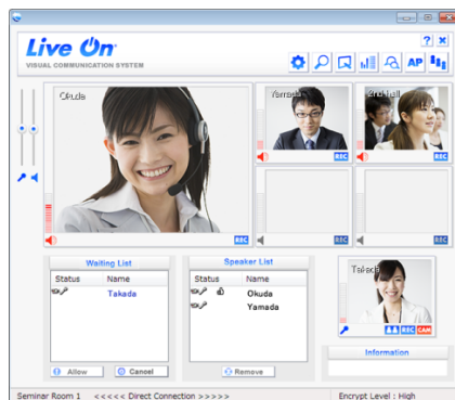
Multi-user mode images

Multi-user mode allows you to stream seminars to an unlimited number of participants.